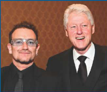
Award recipients Bono and President Bill Clinton at the Atlantic Council Annual Awards Dinner

These worlds of defense and development are inextricably linked. They're not the same thing; they're very different. But they're linked and we need to see them as part of the same picture. They're both essential if we really want to build a world that's more secure, more prosperous and more just. And it's more important than ever that we see those connections, especially in asymmetrical conflicts.