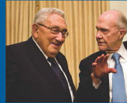
Dr. Henry Kissinger, General Brent Scowcroft and U.S. Ambassador to the UN Susan Rice speaking at Atlantic Council strategy sessions